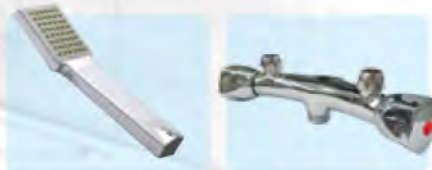
Airjet environmentally friendly showerhead and mixer

The following is the comparison of opening water flow at the same time