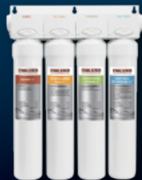
Stream 5S 純清源