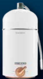
Fountain 7S 純清泉